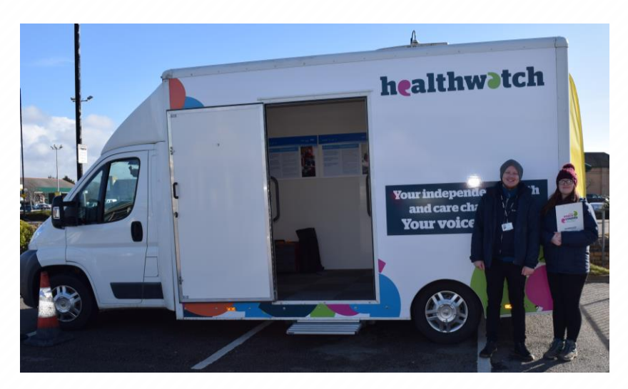
The Healthwatch Chatty Van; one of our many engagement tools.

A full breakdown of each of these projects can be found on the next page.