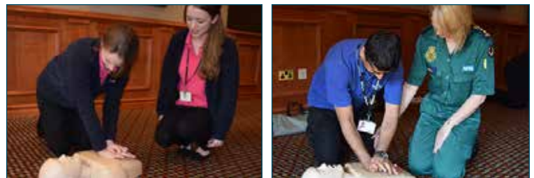
Pictured above: Healthwatch Lancashire staff members receive training from a North West Ambulance Service paramedic.

Pictured above: The Healthwatch Lancashire team at Leyland House on Lancashire Business Park.